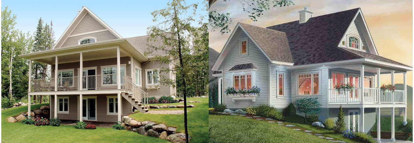
1,480 sf - 2 Bedrooms - 2 Baths - MB on 1st Floor - Covered Porch

Build a House You Can Own instead of One That Owns You